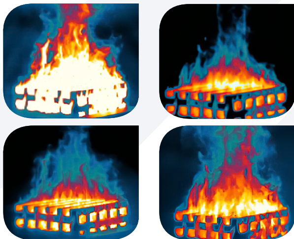
Multispectral image of burning wood crib