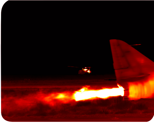
Jet Engine IR Signature Measurement