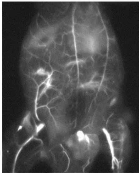
Fig.1 Fluorescence imaging: visualization of blood vessels in a mouse [SHI].

In recent years, research groups around the world have been developing different fluorescence agents with a more pronounced shift to the NIR-II or SWIR biological window for in-vivo imaging. Moreover, with the commercialization of affordable InGaAs SWIR cameras that show excellent sensitivity and quantum efficiency in the wavelength range above 1000 nm, in-vivo imaging utilizing NIR-II or SWIR emitting fluorescence agents has become more accessible. For instance, Shimadzu (Kyoto, Japan) developed the portable SAI-1000 in-vivo bioimaging system equipped with a SWIR InGaAs camera [HEM, XU]. This system is developed for small-animal imaging for preclinical research with the ultimate goal of earlier disease detection in human patients.