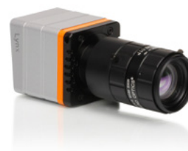
Figure 2: High-speed InGaAs line-scan camera Lynx 512 CL.

With its path-breaking InGaAs line-scan camera Lynx (figure 2), which was introduced in 2010 and is used by Tomra since 2013 in a continuously expanding range of sorting systems, Xenics has established new performance categories for resolution and cost efficiency in the shortwave infrared between 900 and 1700 nm. The Lynx is based on the proven linear sensor series XLIN-1.7. It provides high optical sensitivity and a broad dynamic range for industrial image processing and optical coherence tomography. A/D conversion is done at 14 bits. Integration time setting offers flexibility from 1 \mu s to several milliseconds. The Lynx is available with a CameraLink or GigE Vision interface.