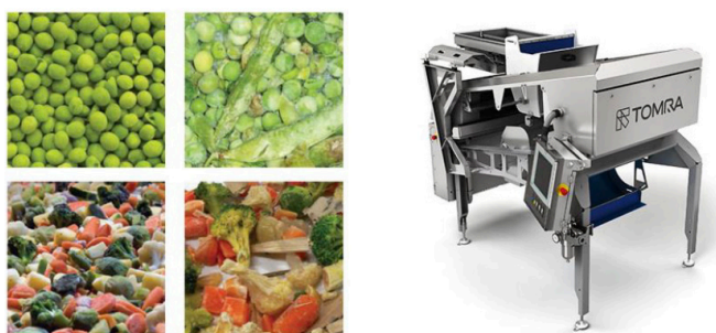
Figure 1: Food sorting system detects defects and inappropriate shapes of fruit and vegetables in the visual & SWIR realm.

tasks. Spectroscopic analysis of food items examines them in terms of their structural make-up and hidden defects by observing their spectral response to specific illumination wavelengths in the visual and SWIR realms (figure 1). For this spectroscopic analysis in SWIR, Xenics has developed a custom-made InGaAs detector for Tomra. This method delivers more information on the goods examined and it enables a more detailed classification in regard to quality and the state of freshness of certain food items and their 'Biometric Signature Identification'. BSI enables to identify slight, otherwise suitability for human consumption. This has led Tomra to the development of a technique that it calls unnoticed chemical and molecular differences in the inspected food items and it serves as a differentiator of their quality and suitability. This development has earned Tomra the 'Excellence in Research and Innovation Award' at the 2015 INC Congress.